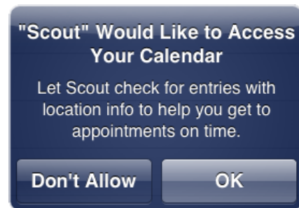
Figure 1. A calendar permission request for the Scout app including a developer-specified purpose string explaining the reason for the request.

http://dx.doi.org/10.1145/2556288.2557400